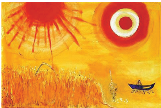
A Wheatfield on a Summer's Afternoon – Marc Chagall